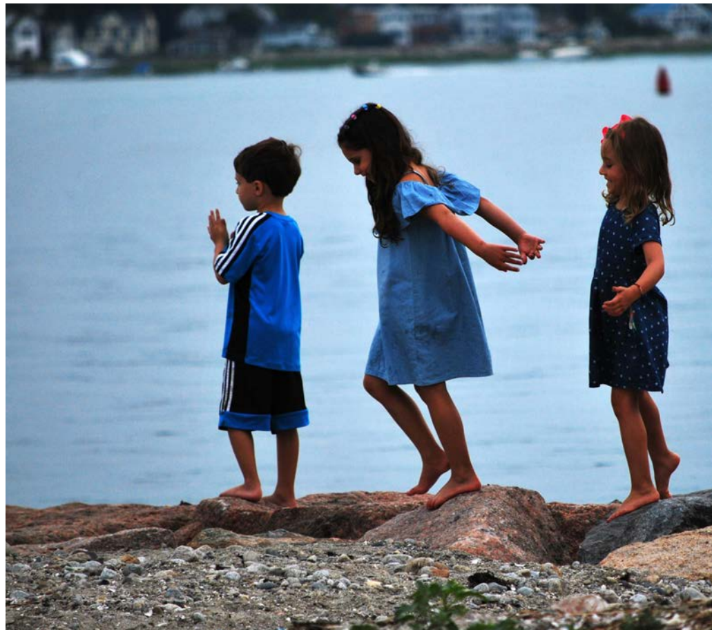
Our children embody Wonder, Hope and Awe as they explore at Shabbat on the Beach.

There is no question that we are among the most fortunate human beings on earth. Nonetheless all of us lose sight of the many miracles of our existence, much like the